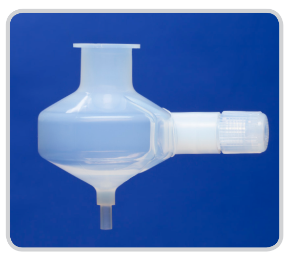
Side view of the PFA CSC (no exit port fitted) showing deep spoiler molded into sidewall

A partial listing of instrument compatibility is given in the ordering instructions. Part numbers 821-103 (with baffle) and 821-104 (without baffle) have a 12/5 socket connector which is commonly used in ICP-OES instruments. Typically, a baffle is used with ICP-MS but not with ICP-OES or MP-AES, since the baffle removes larger droplets which may overload the plasma in ICP-MS. The function of the baffle with the untreated PFA CSC is not as critical as with glass and quartz cyclonics, however, since the larger droplets tend to be removed through absorption by droplets on the side walls.